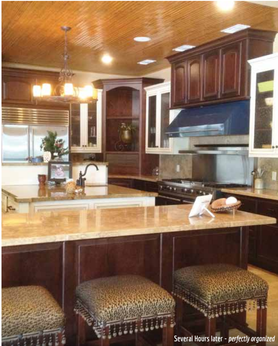
Several Hours later - perfectly organized