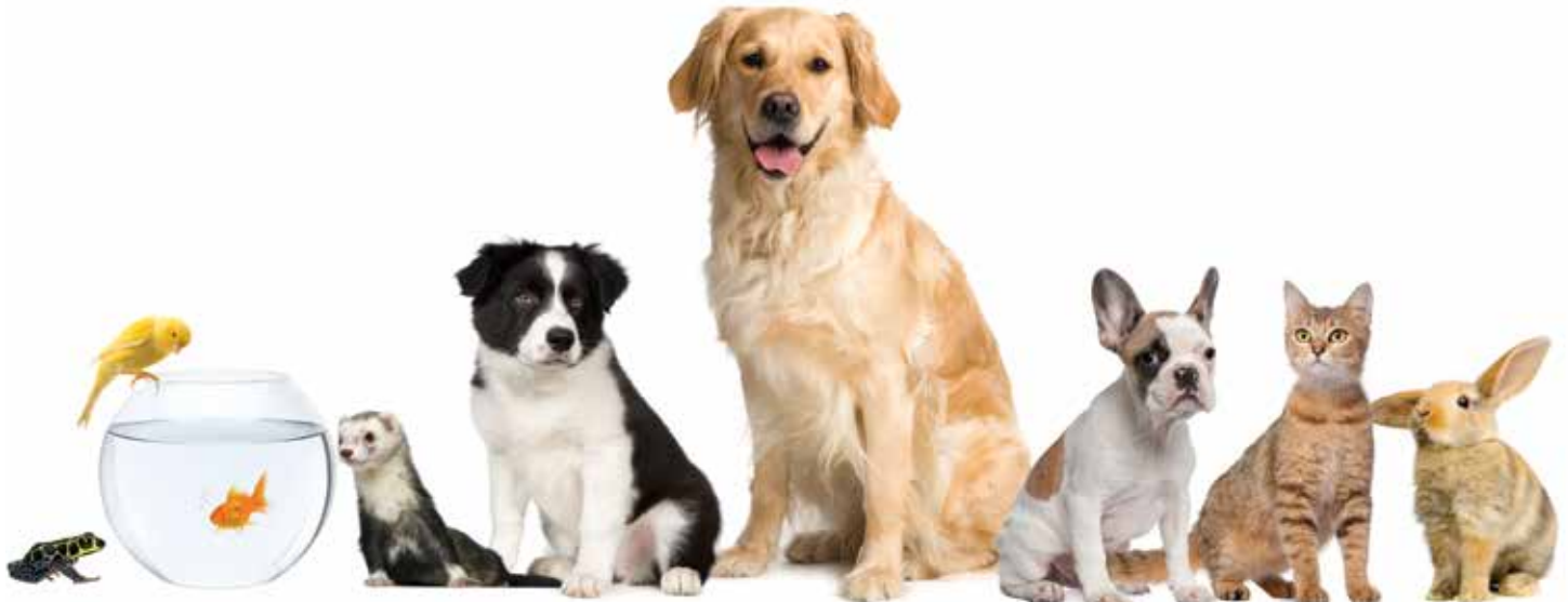
Our focus includes protecting and feeding your pets. We make sure there's dinner for each pet - and that that no one IS dinner.