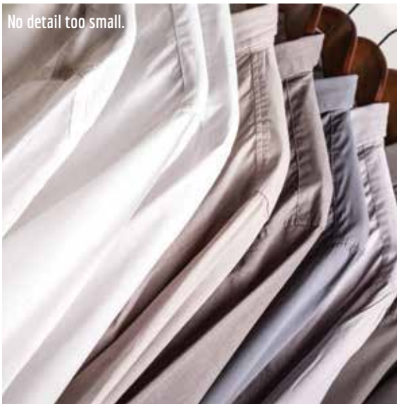
No detail too small.