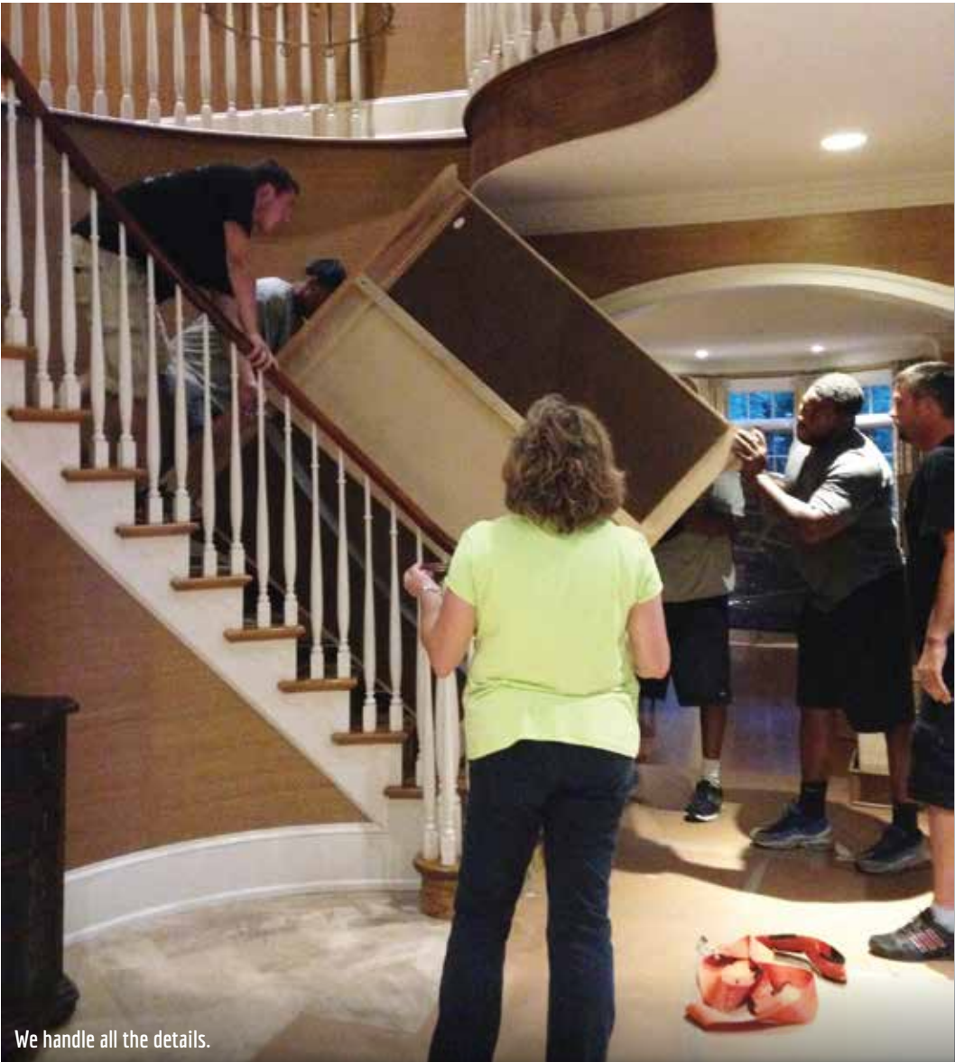
We handle all the details.