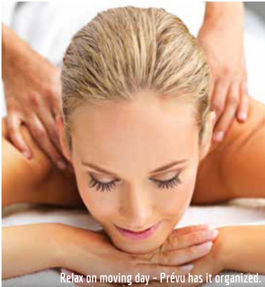
Relax on moving day – Prévu has it organized.