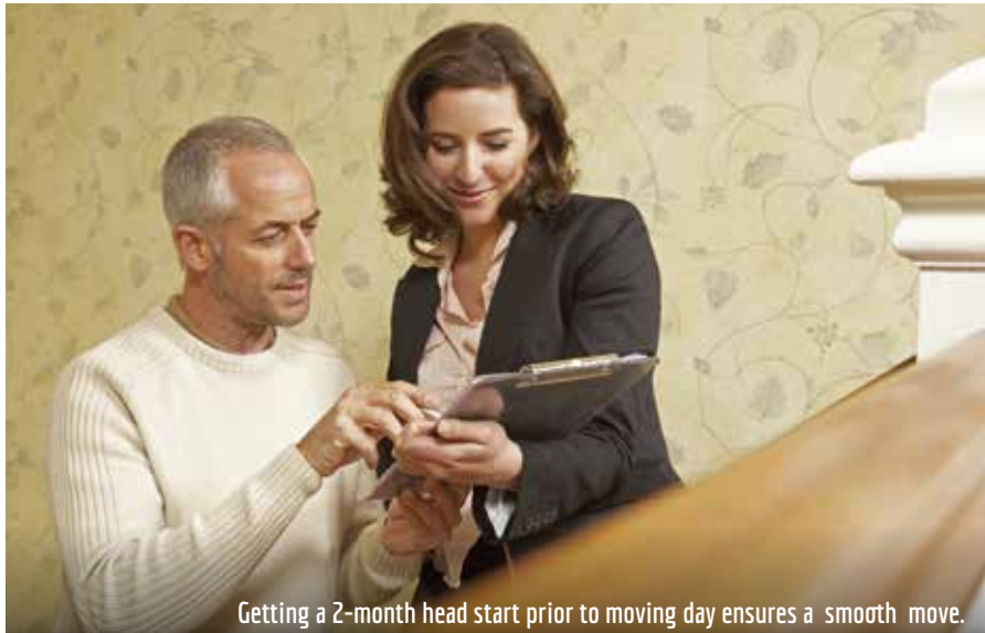
Getting a 2-month head start prior to moving day ensures a smooth move.

We can recommend trusted, proven moving companies and service providers, manage all move preparations, and remain on-site throughout the actual move to handle and oversee everything. Our services can cover all of the requirements for your move, including short-term corporate housing, utilities transfer, meals, housekeeping, pet care, and much more. Our team of professional organizers will ensure that all items are carefully packed, meticulously unpacked, and placed according to your pre-arranged instructions in your new home, allowing you to settle in the moment you arrive.